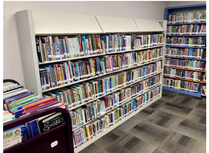
Photo Caption: Town Hall's Lower Conference Room has been reconfigured for library operations and programming

With the priority on meeting the Labor Day deadline, town officials and the Library Trustees worked to secure and coordinate a temporary relocation of the Dighton Public Library to the Town Hall Complex.