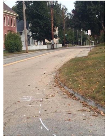
The intersection of Main and Elm Street is one of many areas receiving upgrades from Shared Streets grant funding

Addressing accessibility barriers throughout the Dighton community is an ongoing priority for the Board of Selectmen, the Dighton Commission on Disability and Dighton Highway Department. Together with residents, we have been working to